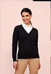
SOL'S GOLDEN WOMEN 90012