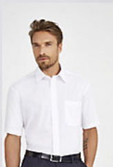
SOL'S BRISTOL 16050